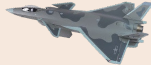
Model of J-20 fighter jet