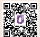
Webpage QR Code

Group Tour Docent Services: Schools, community organisations, and other institutions are welcome to apply for free docent services through electronic means. Please refer to the QR code provided below for further details.