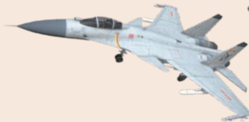
Model of J-15 fighter jet