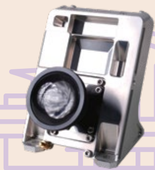
Model of Mars Camera