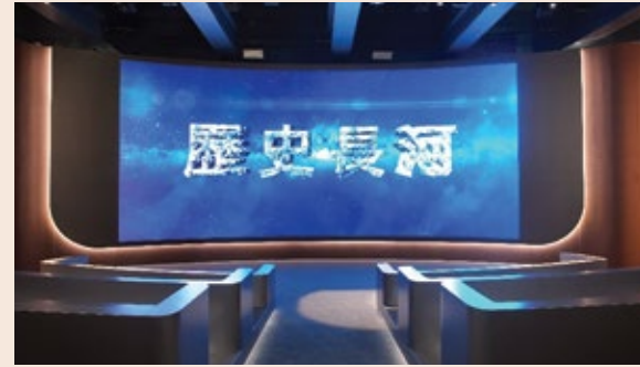
"Ebbs and Flows of History" Motion Theatre