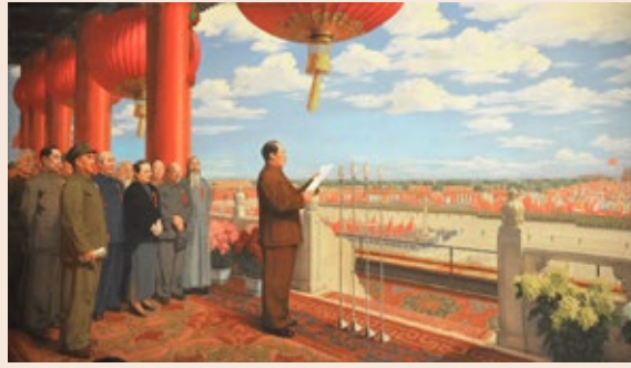
Oil painting titled "The Founding Ceremony of the People's Republic of China" (authorised replica)