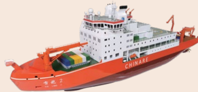
Model of Xuelong 2 polar icebreaker