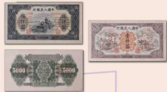
Samples of the 1,000 Yuan and 5,000 Yuan banknotes first issued by the People's Bank of China