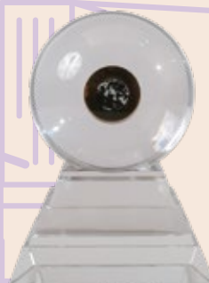
Lunar soil "Bright Moon Over Our Journey Home"