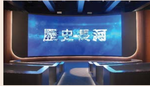
"Ebbs and Flows of History" Motion Theatre