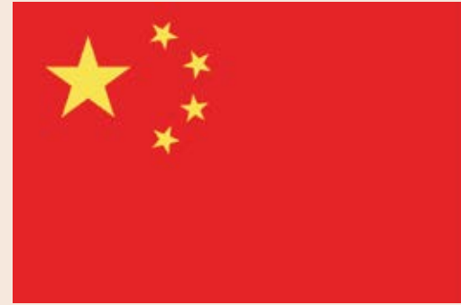
The national flag hoisted at Tiananmen Square on the day when the Hong Kong National Security Law was promulgated