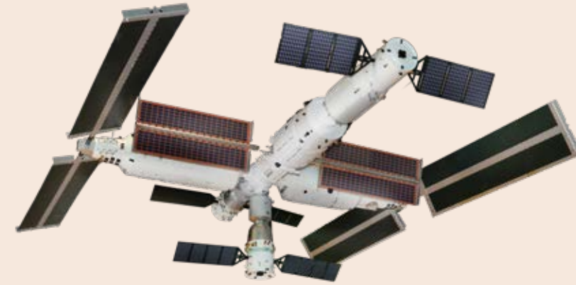
Model of China Space Station