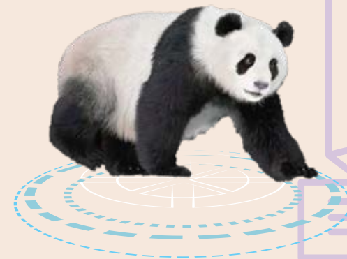
3D levitating images - A new experience