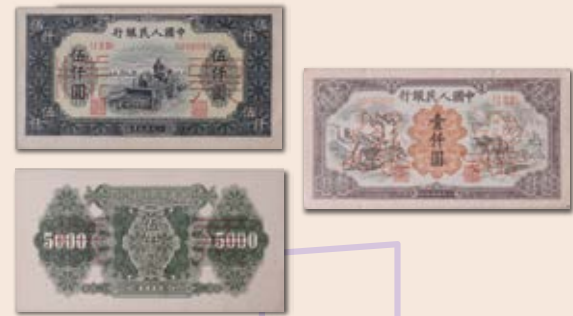
Samples of the 1,000 Yuan and 5,000 Yuan banknotes first issued by the People's Bank of China