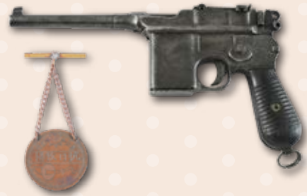
Mauser pistol of the Dongjiang Column, and commemorative medal for contribution in the Chinese People's War of Resistance Against Japanese Aggression