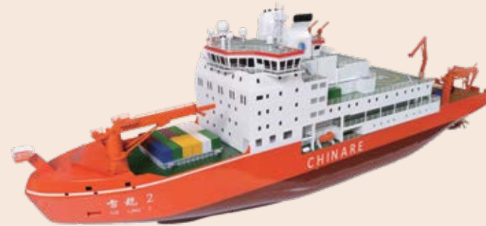
Model of Xuelong 2 polar icebreaker