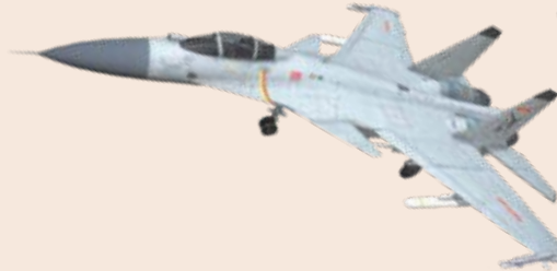
Model of J-15 fighter jet