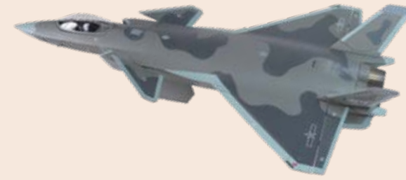
Model of J-20 fighter jet