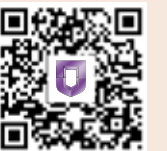
Webpage QR Code

Group Tour Docent Services: Schools, community organisations, and other institutions are welcome to apply for free docent services through electronic means. Please refer to the QR code provided below for further details.