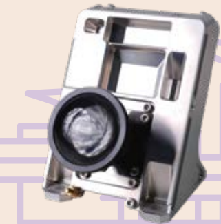
Model of Mars Camera