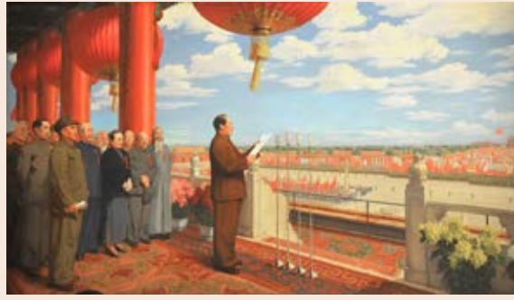
Oil painting titled "The Founding Ceremony of the People's Republic of China" (authorised replica)