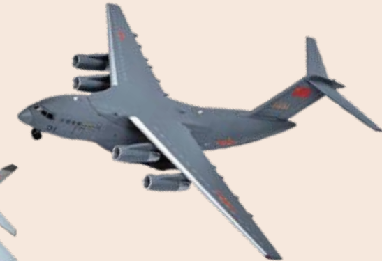
Model of Y-20 transport aircraft